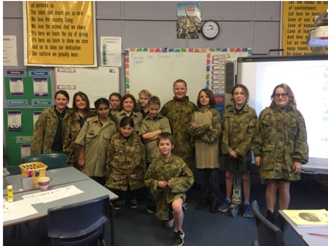
Photo: Wearing Miss Ieroianni's old Army uniforms to learn about Australian History.