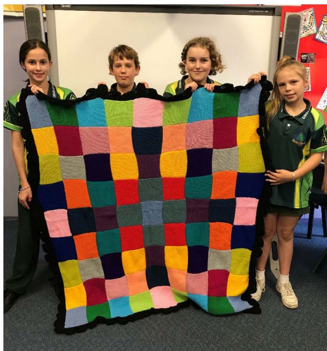
The finished product to be raffled at the Open Day