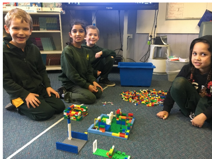
Lego reward activity