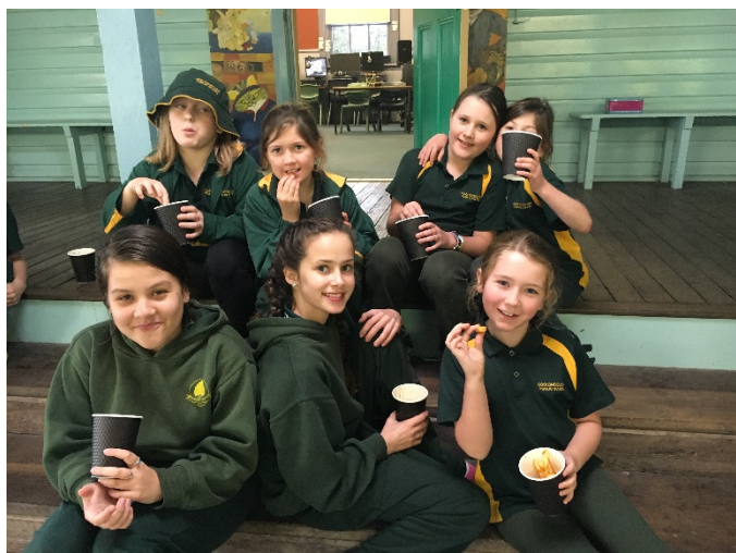
Some of the girls enjoying hot chips after winning the Small Schools Champion's trophy