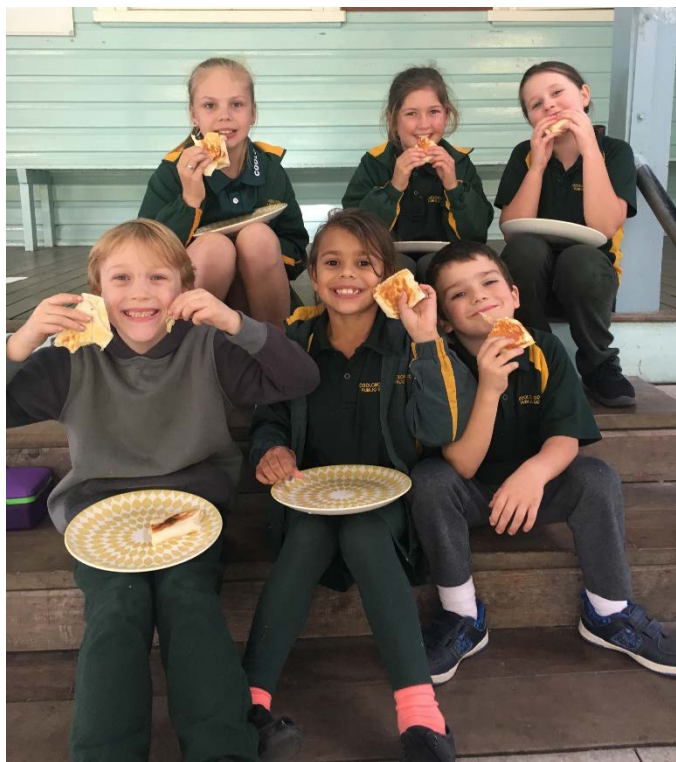
Cooking reward activity

During Term 2, students have enjoyed different activities such as cooking, pottery, computer activities, various craft activities and building with Lego. For Term 3 students have completed a survey so we can deliver activities chosen by them.