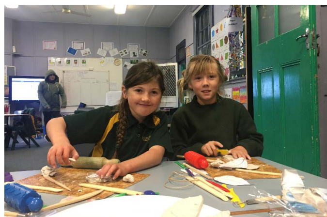
Pottery reward activity